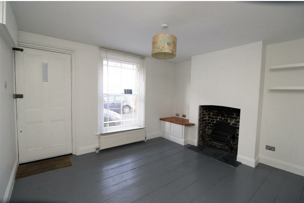
Lounge 12'06 x 10'6 (3.81m x 3.20m)

Woodward&Bishopp are delighted to offer this spacious, well presented home situated in the conservation area of bustling Whitstable town where you will find an array of cafes, restaurants, harbour and many independent boutique shops. Accommodation comprises: Lounge, Impressive Kitchen/Dining Room with appliances, Bathroom with bath & separate shower enclosure, two double bedrooms on the first floor & one double bedroom at the top. Outside is a pretty rear garden. Suit professionals, min annual income £52,500. Available now.